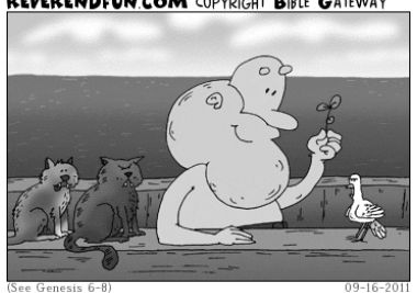
YOU THROW THE CATS OVERBOARD AND I'LL TELL YOU WHERE I FOUND THE BRANCH